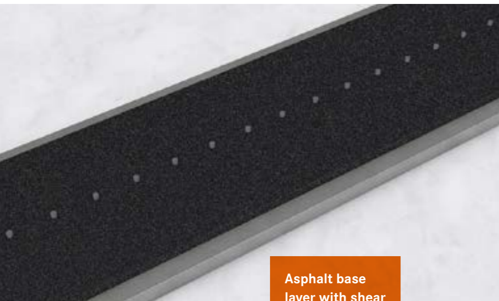
Asphalt base layer with shear dowels

The free spaces between the rail fastenings and the the gaps between the supporting elements are filled with highstrength mortar. This permanently fixes the exact track geometry.