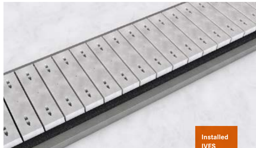
Installed IVES blocks