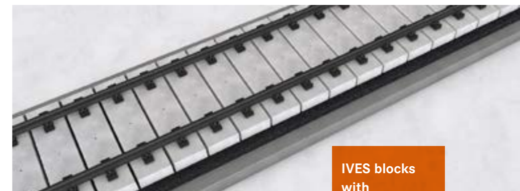
IVES blocks with track panel